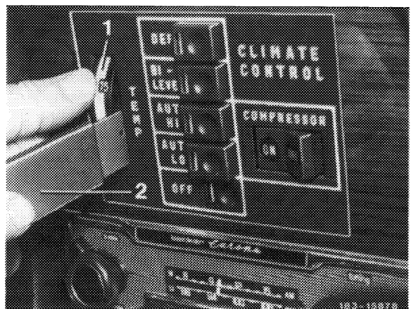
1 Temperature dial 2 Adjusting wrench

5 Hold potentiometer shaft in position by means of adjusting wrench (2) and set temperature dial (1) to 75 °F by rotating on shaft.